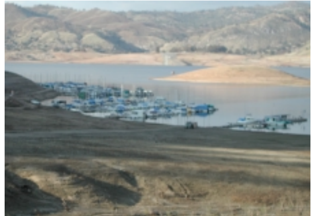
MUDDY MILLI AT ITS FINEST!

This is the time of year we all have been waiting for, then WAM! Blindsided by the new marina operator. Sorry to say it does not look like I will be sailing on Millerton this season. You caught that little thing, charging by the foot this year for slips. Will 33' x $$$$ + Deposit + No parking pass + No parking passes for my crew + Have to pay to launch now = a 90% + increase for me. That all adds up to: See you at Huntington. What ever happened to 12%?